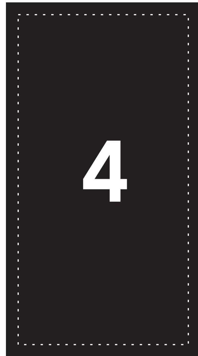
JPEG 4 82mm x 150mm NO BLEED 82mm x 155mm WITH BLEED TEXT WITHIN WHITE LINES ONLY 72mm x 140mm