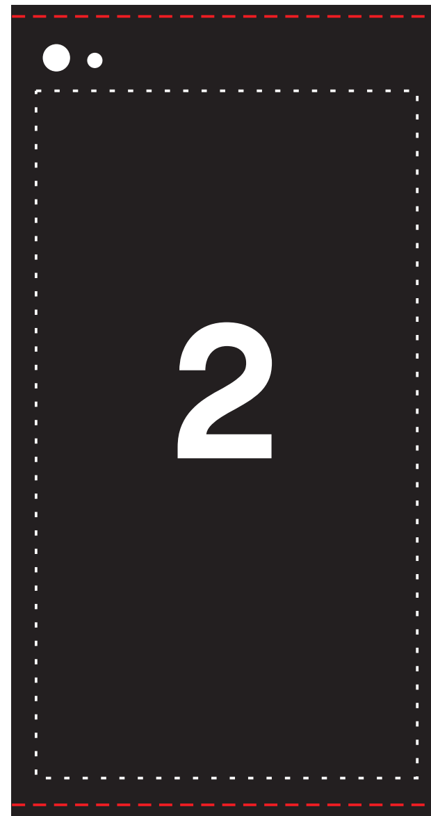
JPEG 2 82mm x 150mm NO BLEED 82mm x 155mm WITH BLEED TEXT WITHIN WHITE LINES ONLY 72.5mm x 131mm