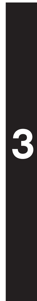
JPEG 3 15mm x 139mm